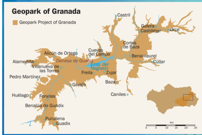
Geopark of Granada

Cuevas Abuelo Ventura Guadix (Granada) ☎ Tel. 958 664 050 🌐 www.cuevasabueloventura.com